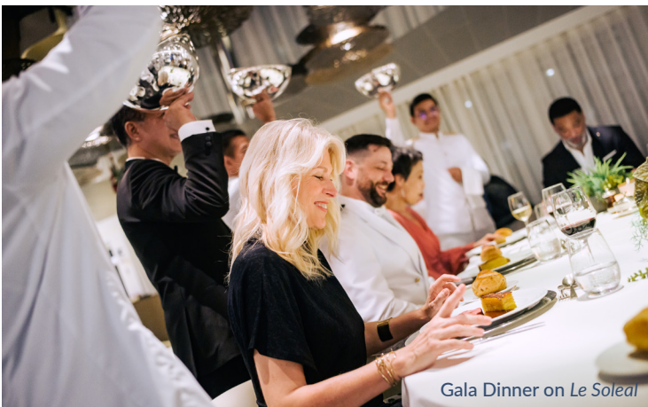
Gala Dinner on Le Soléal