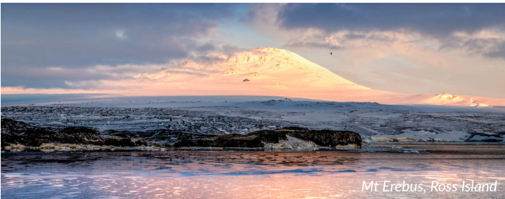
Mt Erebus, Ross Island

Hosted by a member of The Private Travel Company subject to numbers.