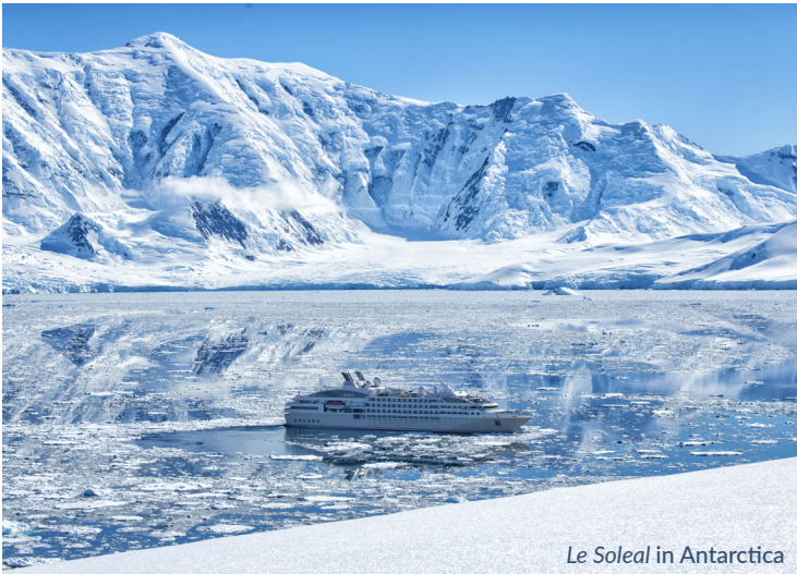
Le Soléal in Antarctica

per person in a Prestige Stateroom with balcony on Deck 4