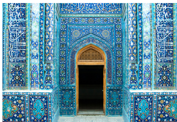
Shah-i-Zinda necropolis, Samarkand

Visit the beautiful, World Heritage fortress of Old Nisa, at the foot of the Kopet Dag Mountains, the earliest of the Parthian Empire capitals. Visit Arkadash stud farm, home of the famous Akhal-Tekke horses, one of the oldest breeds in existence.