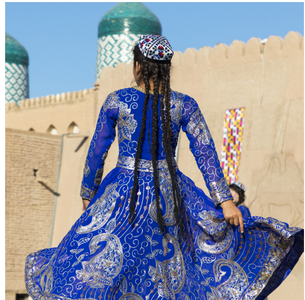
Traditional folk dancer in Khiva, Uzbekistan

Explore this remarkable town, its magnificent Juma mosque and caravanserai.