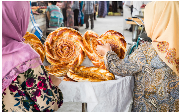
Traditional Uzbek bread

Full day exploration of the beautifully preserved, medieval town of Khiva. Wander the fabled Ichon-Qala (inner walled