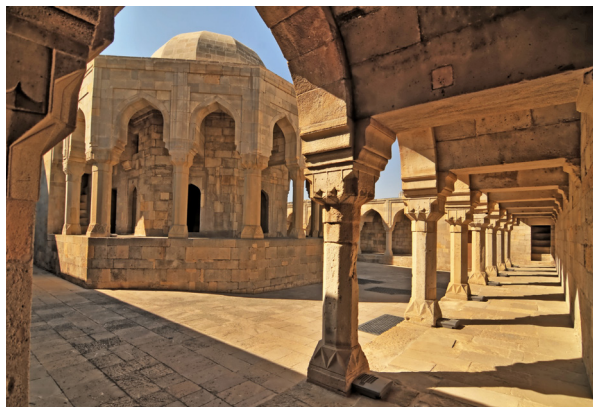
The Palace of the Shirvanshahs in the Inner City of Baku

FRI 2: BAKU (B) Explore fascinating Baku today starting at Martyrs Lane for a panoramic view of the city. Then head into the Old City to see the Shirvanshah Palace, Maiden Tower, Fountain Square and Green Bazaar.