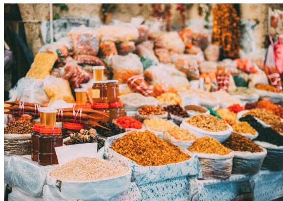
Dried fruits, Tblisi Market

Visit the local farmers market in Telavi before heading to the fortified town of Sighnaghi, famous for its wine and carpet making culture. Enjoy breathtaking views of the Kizikhi area and the unusual charm of Sighnaghi Royal Town. Walk the narrow streets with buildings characterised by their intricately carved wooden balconies. Lunch is a culinary masterclass and wine tasting before continuing to Tbilisi.