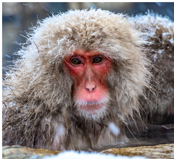
Snow Monkey, Yudanaka