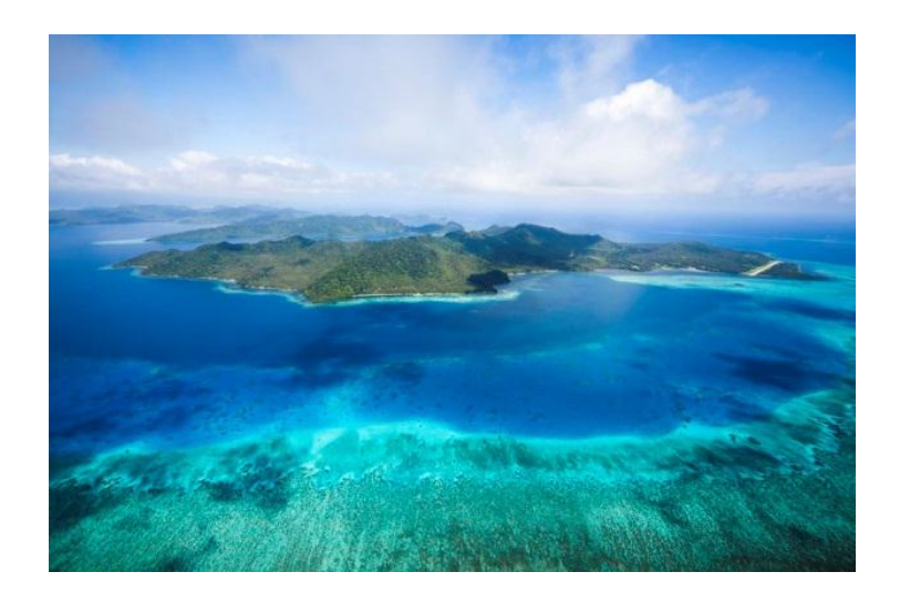
Laucala Island Activities