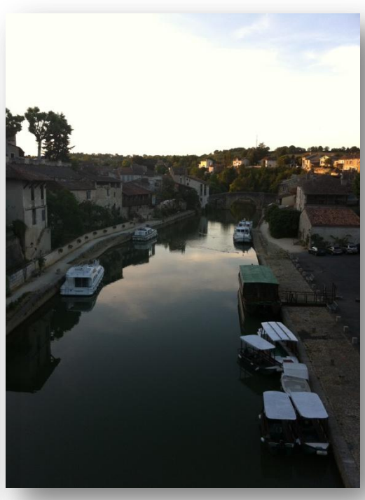
BEAUTIFUL VILLAGES ALONG THE BAISE