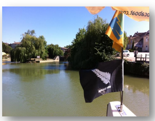
FLYING THE SILVER FERN