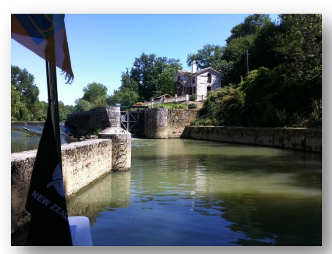
ARRIVING AT A LOCK

As soon as we left Agen and headed along the Garonne on our way to meet the Baise River we arrived at our first set of locks. The stress on the faces of our 'Captains' was obvious, but we managed them very well and by the time we had done three or four we considered ourselves pros and even started to become critical of others. We had to start looking good quickly as we were flying the New Zealand flag from our stern and the Sliver Fern from our Bow, so we were very easily identified by the locals. With cheers of All Blacks, New Zealand and World Cup were powered through the locks and under bridges that often had people Canal boat watching.