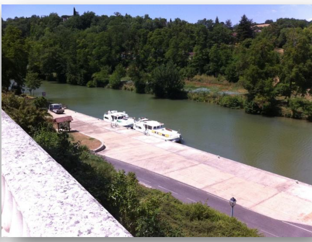
OUR PENICHETTES IN NERAC