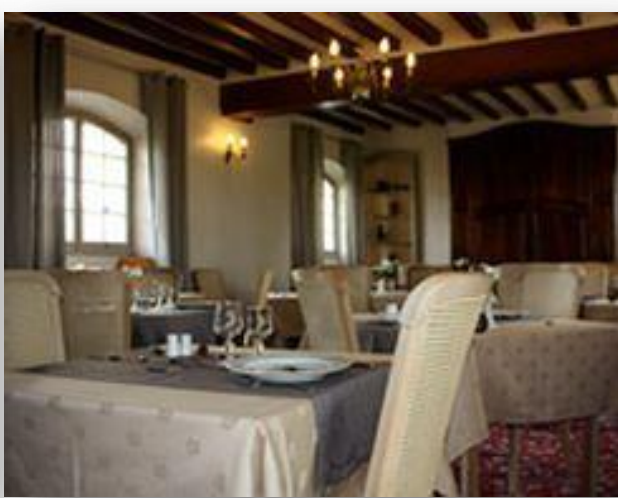
LE PRINCE NOIR