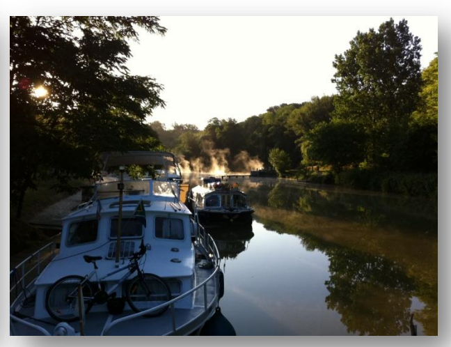
WATER SIDE RESTAURANTS IN NERAC