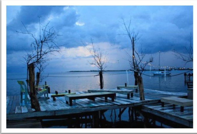
Out the back of Barbulus

the sea. I had ordered the large whole lobster with salad and rice which cost $19 US (yes, the price is correct). The islands tend to borrow culture from many walks of life which is best exhibited in their cooking style. From strong spices to light fruit chutneys, Uvilla and the Bay Islands is a melting pot of flavours to explore. Finishing up with a couple of cocktails we pondered the only logical next step, how are we going to leave?